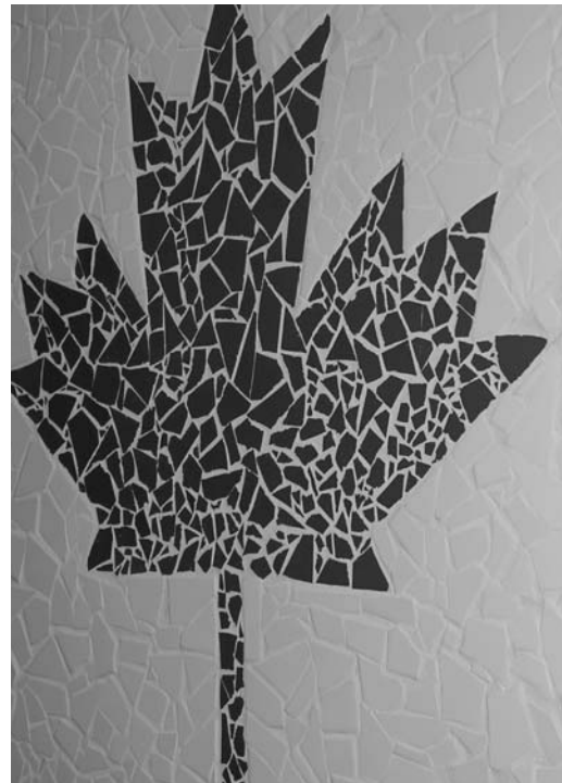
This flag was created using real tile.